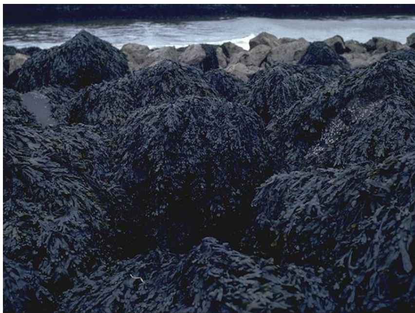
Fucus vesiculosus on full salinity moderately exposed to sheltered mid eulittoral rock