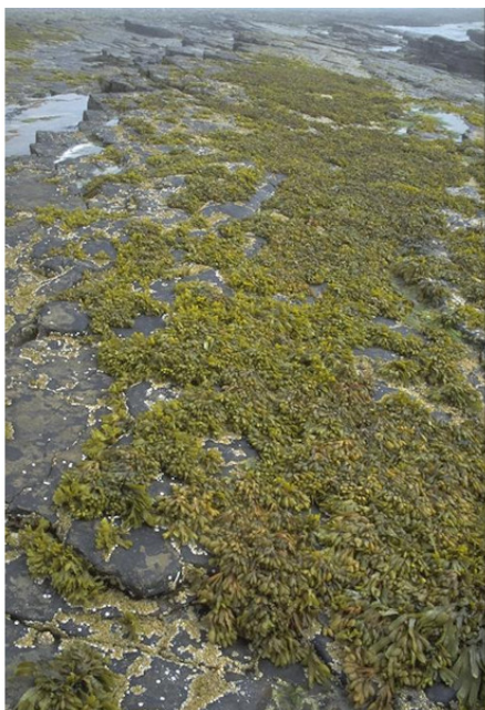
Fucus spiralis on full salinity sheltered upper eu littoral rock