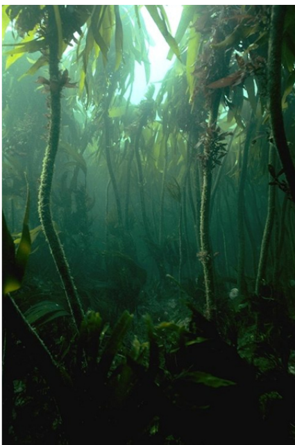
Laminaria hyperborea on tide-swept, infralittoral rock