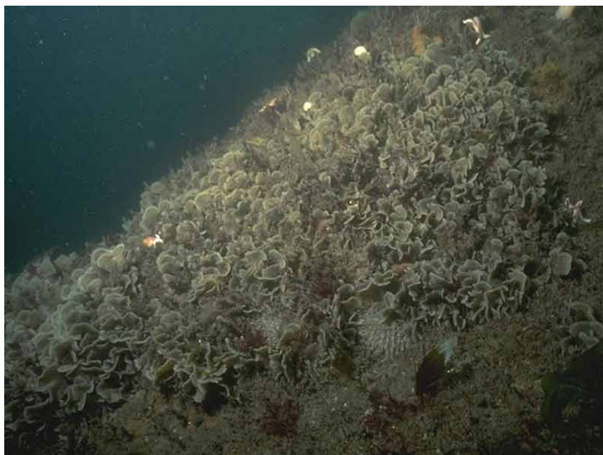
Flustra foliacea , small solitary and colonial ascidians on tide-swept circalittoral bedrock or boulders