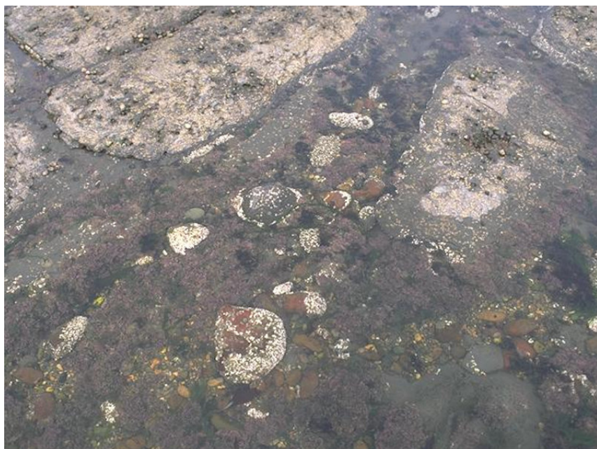
Coralline crusts and Corallina officinalis in shallow eulittoral rockpools