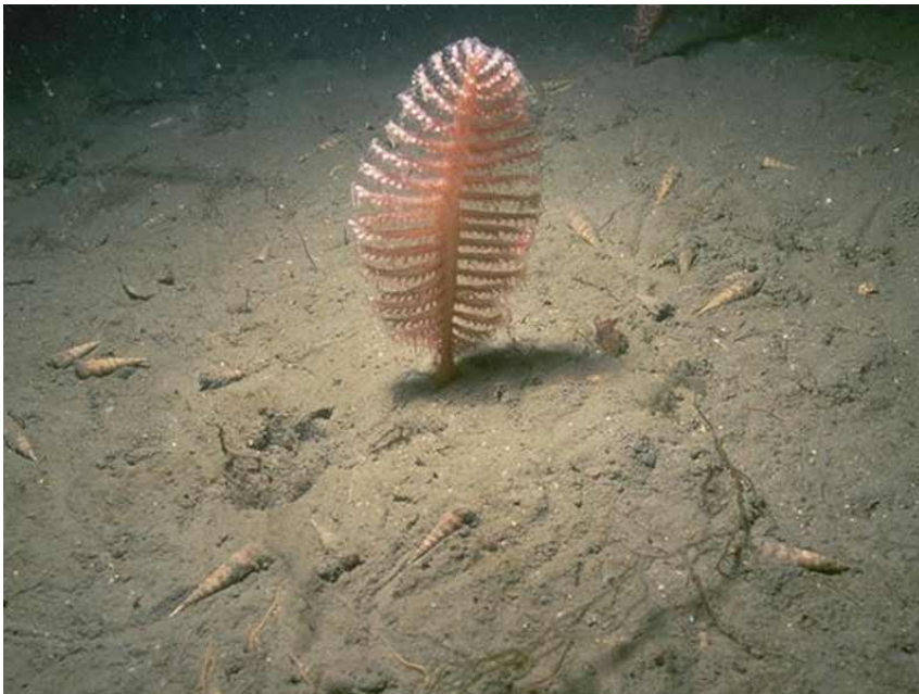
Pennatula phosphorea and Turritella communis in muddy sediment.