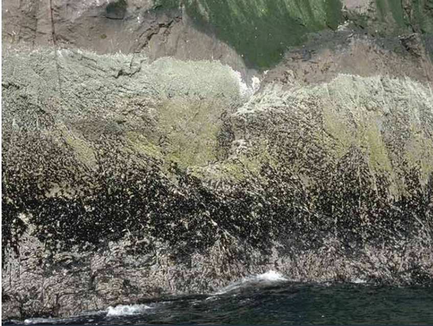
View of vertical bedrock shore.