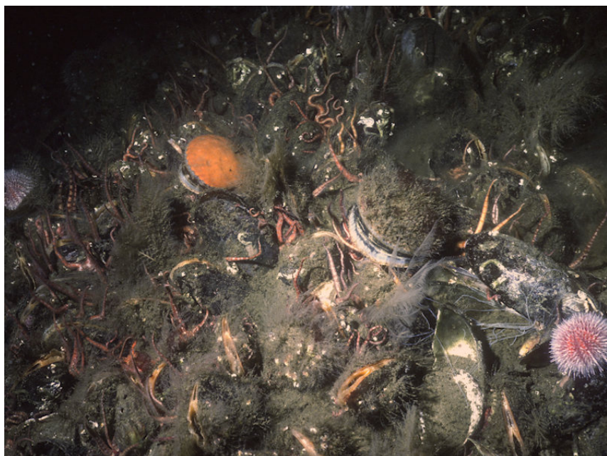
Modiolus modiolus beds with Chlamys varia, sponges, hydroids and bryozoans on slightly tide-swept very sheltered circalittoral mixed substrata