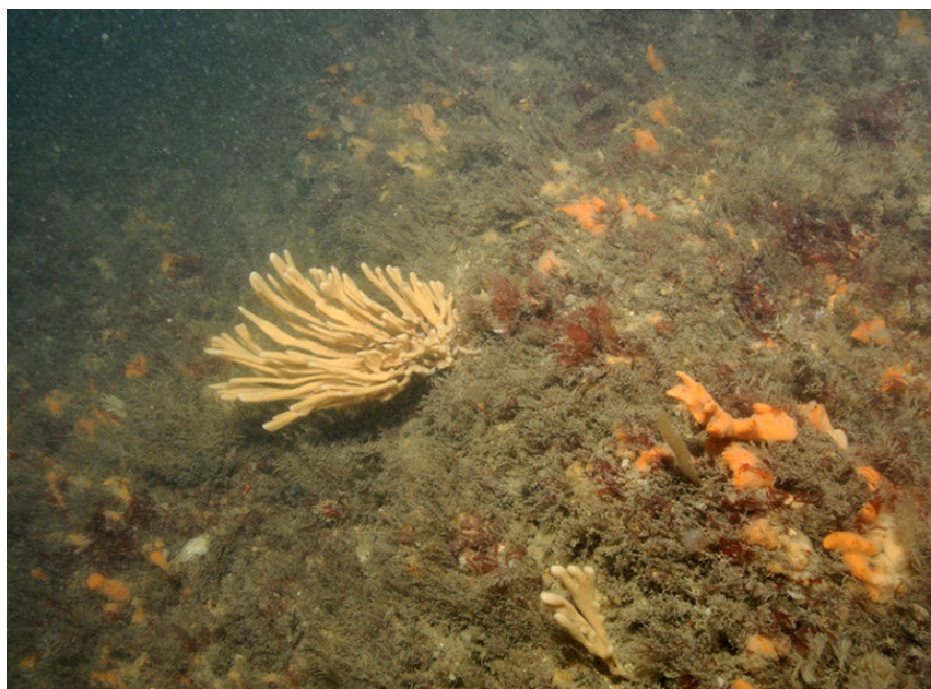
Flustra foliacea and Haliclona oculata with a rich faunal turf on tide-swept circalittoral mixed substrata