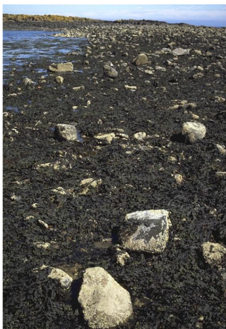
Fucus vesiculosus on moderately exposed to sheltered mid eulittoral rock