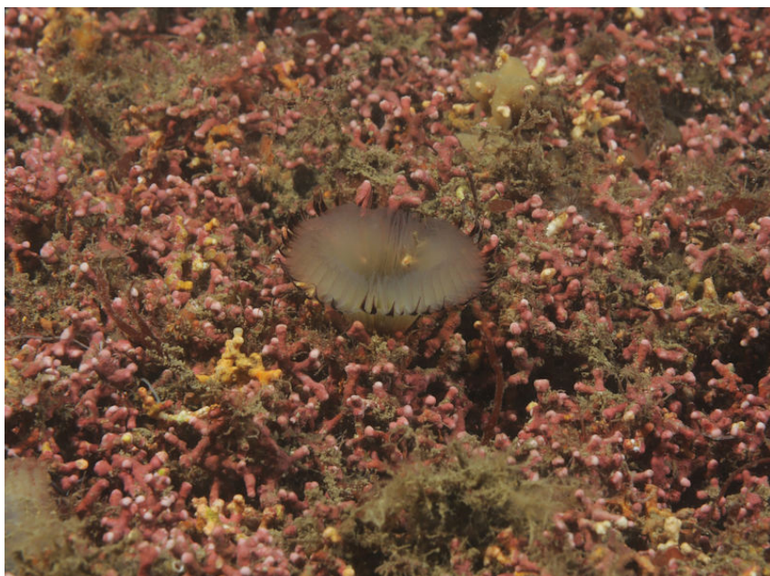
Lithothamnion corallioides maerl beds on infralittoral muddy gravel