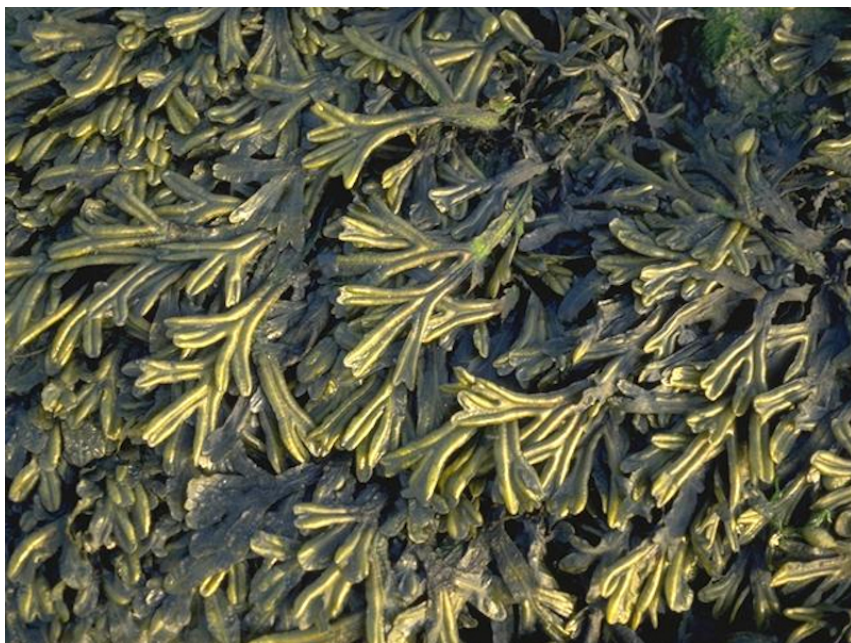
Fucus ceranoides on reduced salinity eu littoral rock