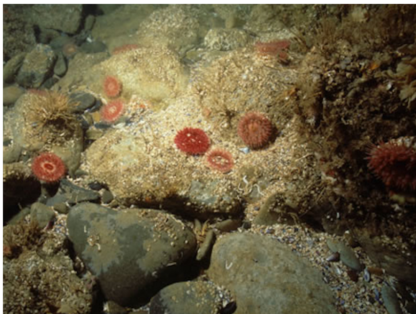
Urticina felina and sand-tolerant fauna on sand-scoured or covered circalittoral rock