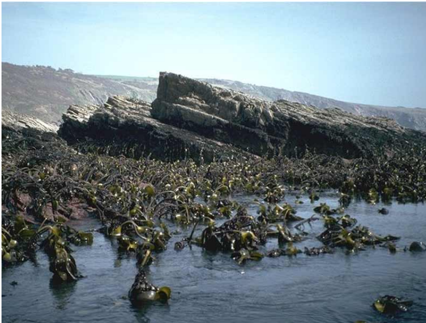
Kelp forest exposed at low tide with rocky shore in background.