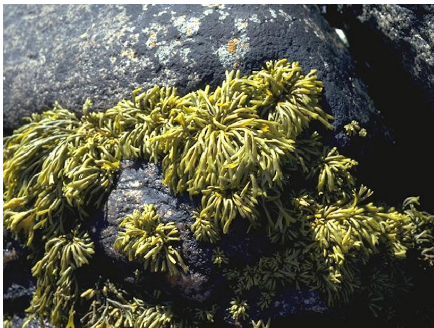
Pelvetia canaliculata on sheltered littoral fringe rock